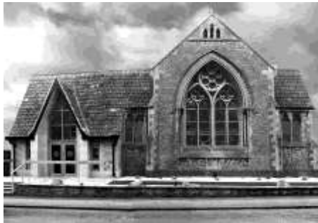
BURNHAM ON SEA